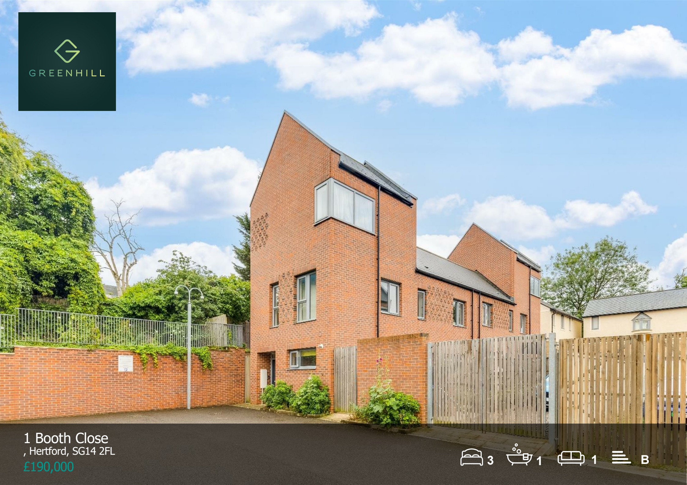
1 Booth Close , Hertford, SG14 2FL £190,000